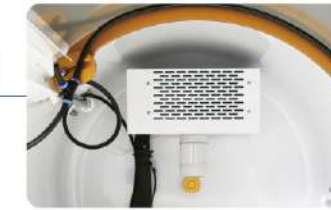
Internal air conditioner