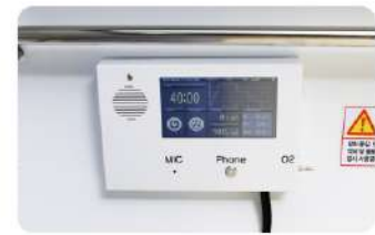
Touchable internal display