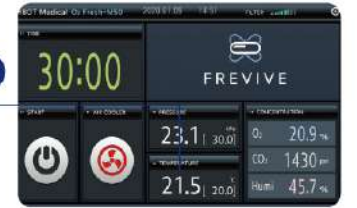
Touchable system display