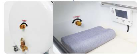
Emergency release valve